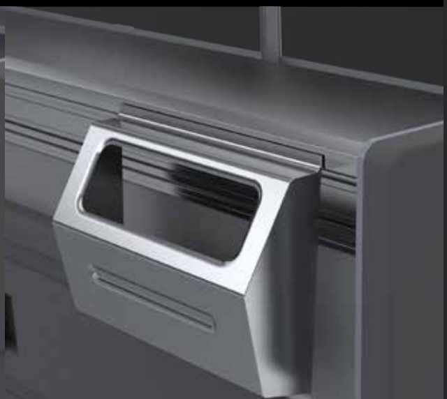
BAG HOLDER 3335630002

2 round slots for butcher's steels and 7 knife slots of various sizes to keep knives organised.