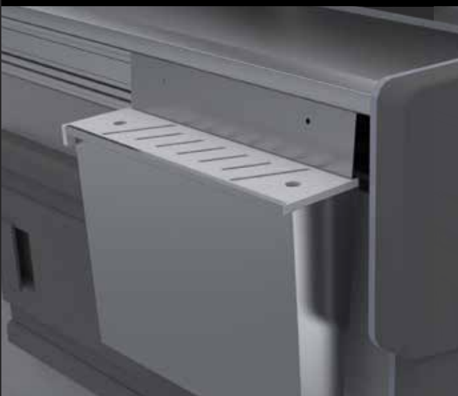
KNIFE HOLDER 3335630001

350mm wide hygienic space for food preparation that can be easily cleaned.